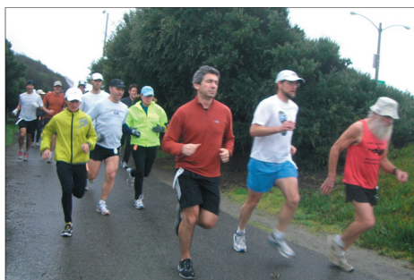
The mid-pack at the Great Highway