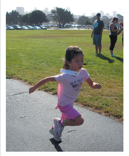
Dashing to the finish in the Kids' Race