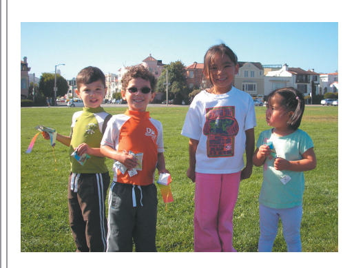
Kids' Race finishers display their ribbons