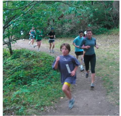
Racing on Golden Gate Park trails