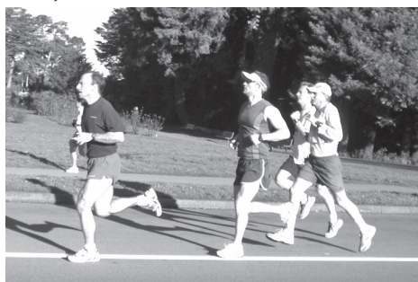
Chasing down Kennedy Drive