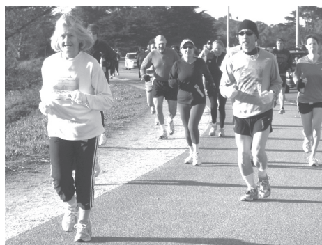
Heading out around the lake