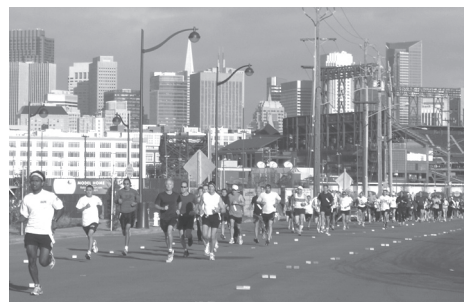
The front pack leaving Mission Rock