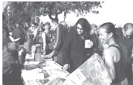
At the registration/snack table