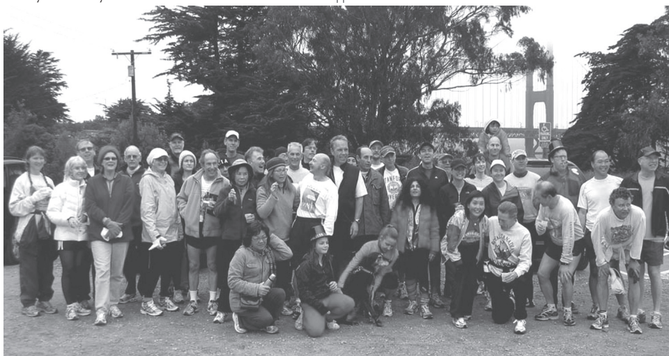
The Annual Hangover Run Group Shot