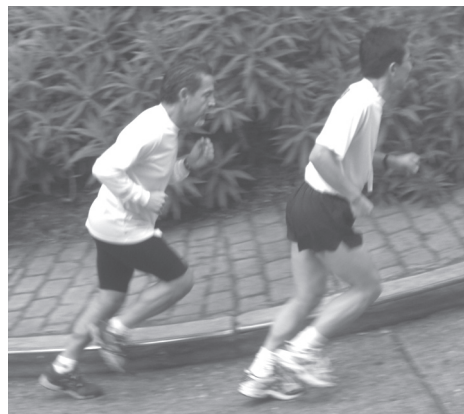
Climbing Vermont, the crookedest street