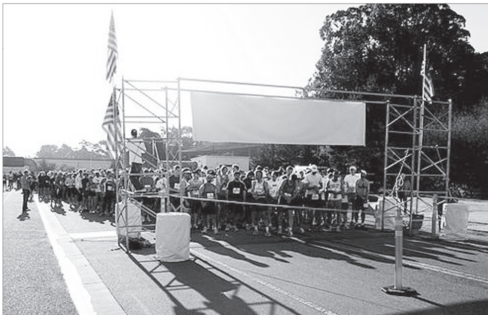
Presidio 10K racers waiting at the starting line