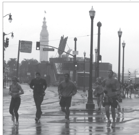
Racing in the rain