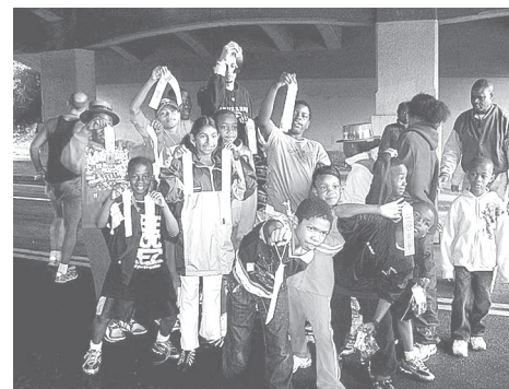
Kids' race runners showing off their finishers' ribbons